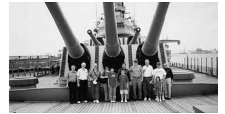
A few of the more than 30 ASM members and guests who toured the Battleship New Jersey in May. A small group of members also stayed on for the Camden River Sharks game which followed.